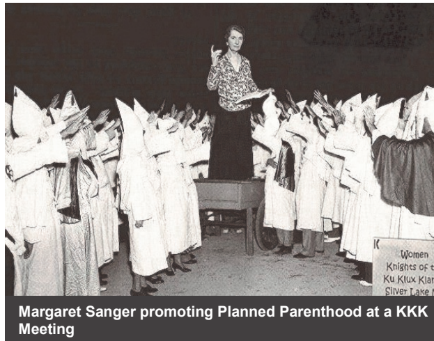
Margaret Sanger promoting Planned Parenthood at a KKK Meeting

Below is a picture of Margaret Sanger, founder of Planned Parenthood. Yes, she spoke at KKK meetings. In a letter to Clarence Gamble, she laid out her agenda against the black race. She wrote, “We should hire three or four colored ministers, preferably with social-service backgrounds, and with engaging personalities. The most successful educational approach to the Negro is through religions