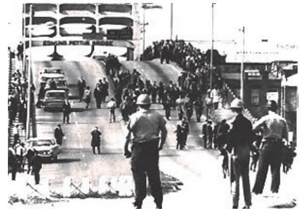
Historic Selma March