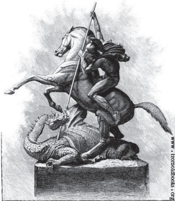
St. George and the Dragon: Cassell, Petter, Galpin & Co.: of Art Illustrated” (1878)