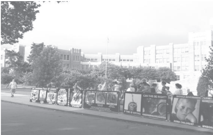
Abortion display at a Little Rock, Arkansas High School