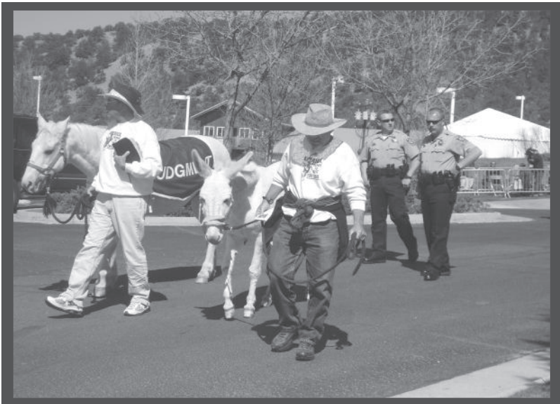
Walk Across America Prophetic Tour