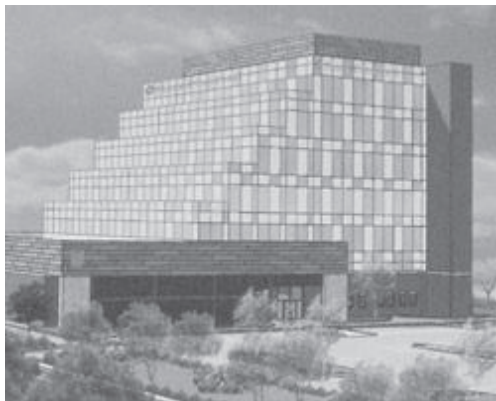
Artist Rendition of the Planned Parenthood Building in Houston, Texas