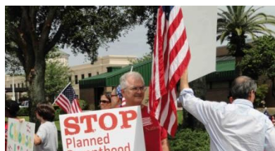
Last Day – Kissimmee stands strong!